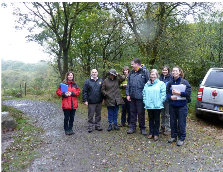
Site visit to Waterfalls area - BBNPA

It should be made clear from the outset that the information presented and the evidence gathered would not have been possible without the enthusiasm, generosity and input from members of the public who responded to surveys and gave up their time to attend hearings. This together with the unfailing support of staff within the respective national parks who contributed to the study has meant that members involved can feel confident that the information presented here is of the highest quality.