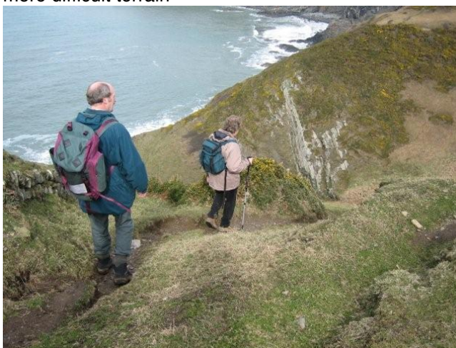
Pembrokeshire National Park Coast trail illustration some of the more difficult terrain