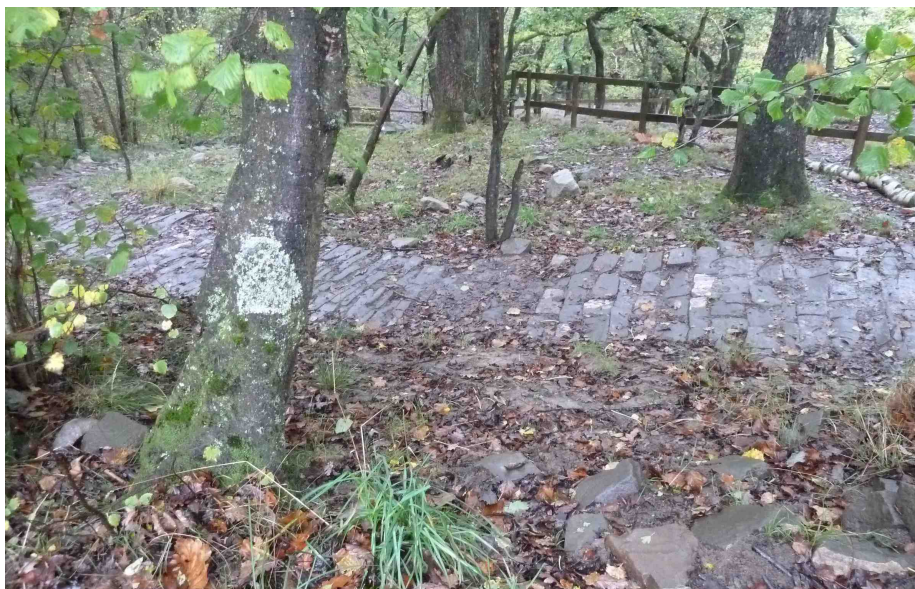
Heavily used footpath leading to the Waterfalls area of BBNPA – all the stone to repair the path had to be brought in by hand.